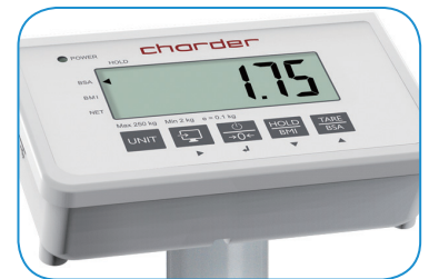
Measures weight, BMI, BSA