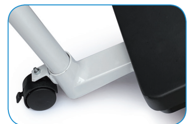
Castor wheel (optional)

Image contains optional Mechanical Stadiometer (HM201M)